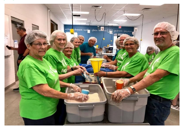
Do you recognize some of these folks from 2018?

Do you have two hours to help fight hunger? Get your gang together and sign up. There is a sign-up sheet on the table in the narthex, next to the name tags. The church has 20 spots for volunteers to come and help pack meals. A few hours can have a big impact and be fun all at the same time.