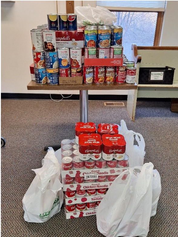
389 Cans of Soup for Caring Hands