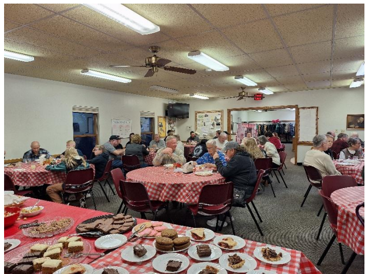
A fellowship hall full of spaghetti lovers