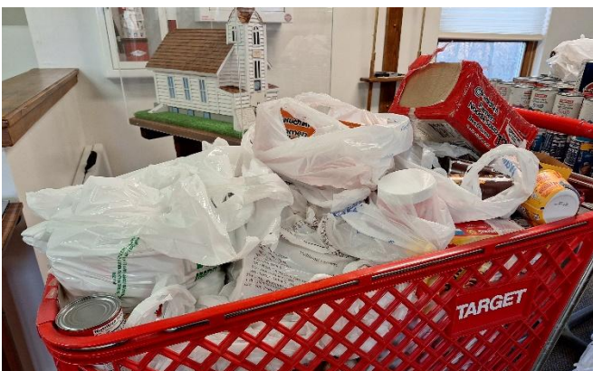
Groceries donated to the Oakwood United Methodist Church Pantry