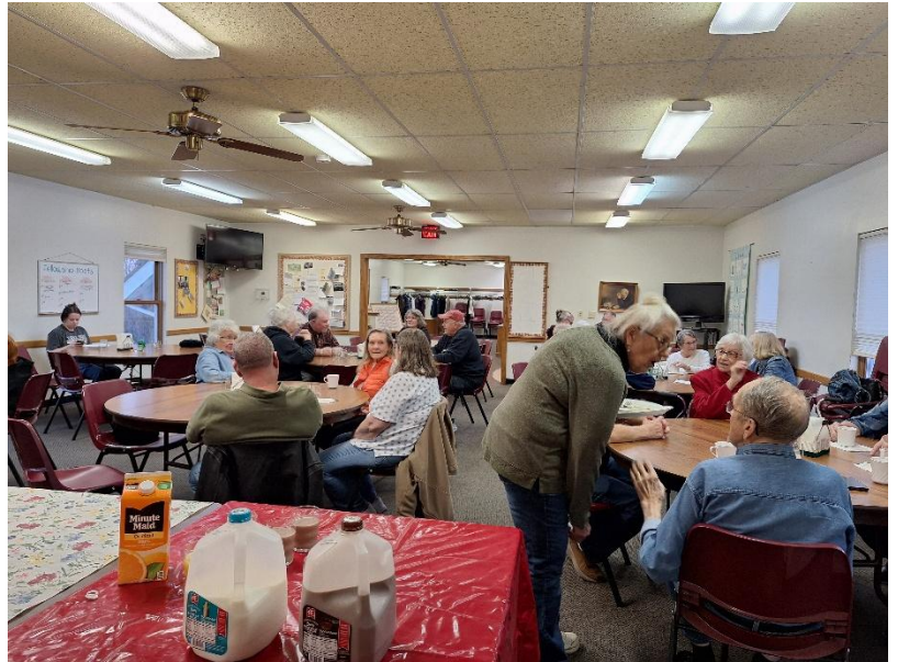
The Pancake Dinner Crowd