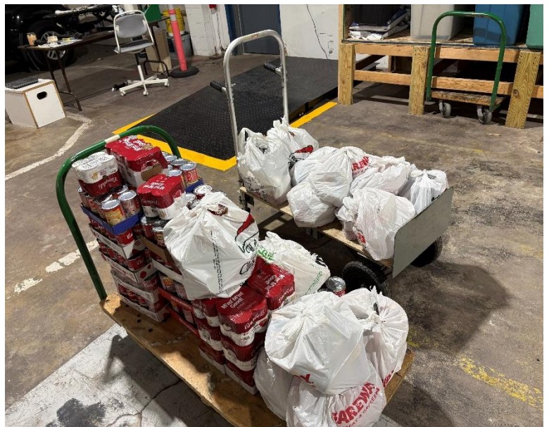
Centennial's donation at Caring Hands 389 cans of soup equal 379 lbs. of food donated!