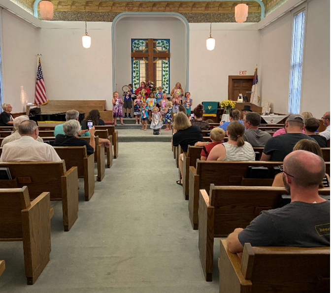
"THE GREATEST SHOW" VBS - JULY 2021