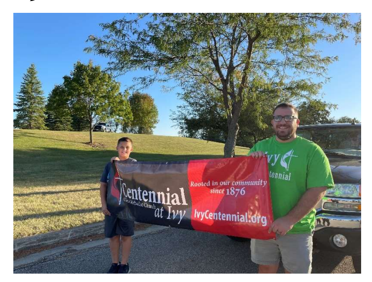
RALLY DAY 2021