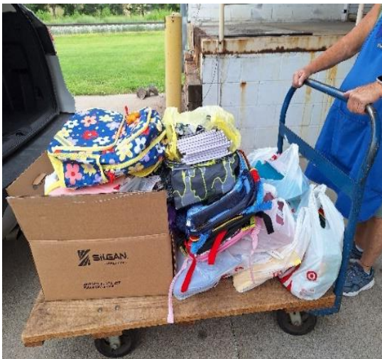
Unloading School Supplies at Caring Hands