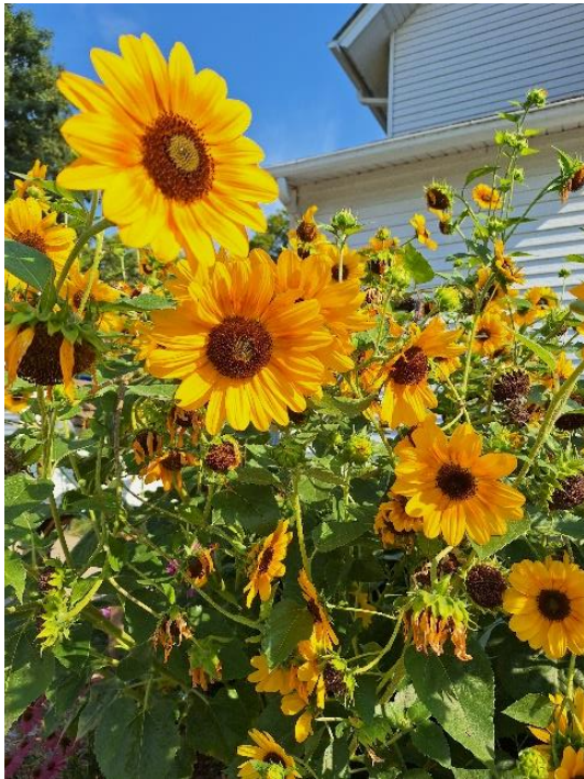
Centennial UMC Sunflowers